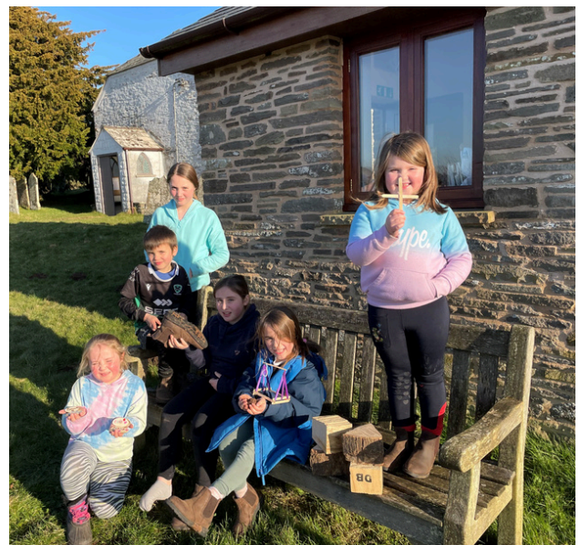
Enjoying Creation at Penyrheol during 'Go Wild'